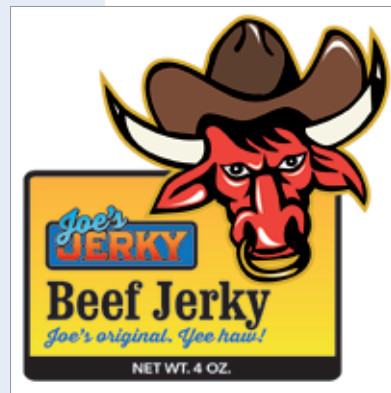
Standard 4" x 4" label